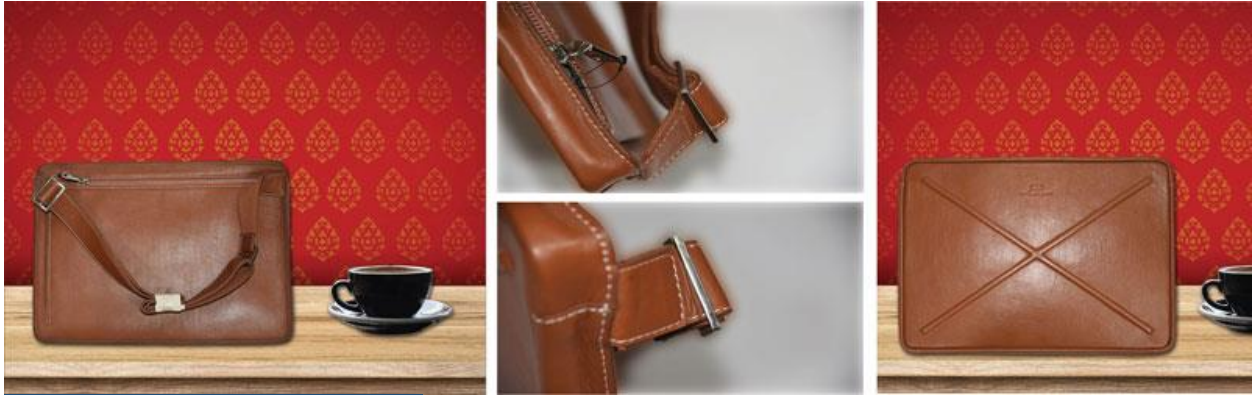
Gents Hand Bag