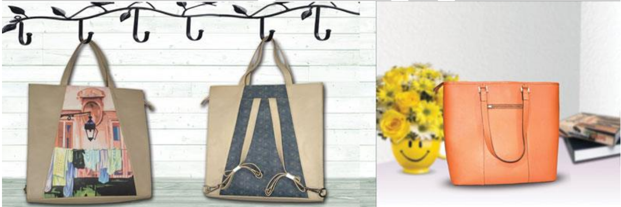
Ladies Shopping Bag